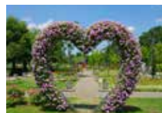
Topiary of the Heart