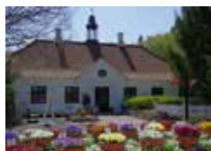
Fairy Tale Pavilion