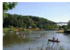
Pond of the Sun