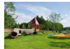
Tunnel of Lizard