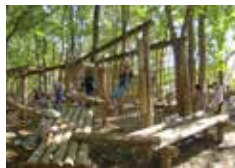
Adventure Playground Course

Kids Kingdom Zone contains many attractions that both adults and children can play freely, including one of Japan's largest Adventure Playground Courses, a Lawned garden, Pony Back Riding, and Petting Zoo Area. Putting Golf Course, Funny Bicycle Riding, Mini Railway, and Balance Ball Mountain are also very popular. Enjoy a variety of food of food shops.