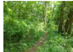
Woods (Walking path)