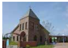
Rest Area & Play Room

The works and playground equipments featuring H.C. Andersen's fairy tales have been placed in the Castel of Flowers Zone. Small children can enjoy creation and fantasy play in this zone.