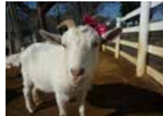
Petting Zoo Area